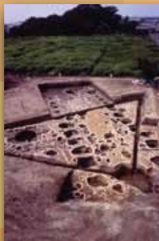
Pillar holes of The Great Building

Ikegami-Sone Site contains the excavated remains of a large and prosperous village built in the Yayoi period, about 2000 years ago. At this site wells and a large "hottatebashira" building have been excavated. This "Great Building" had an area of approximately 130 square meters, and research of the pillars has shown that the wood came from trees cut down in 52 B.C.